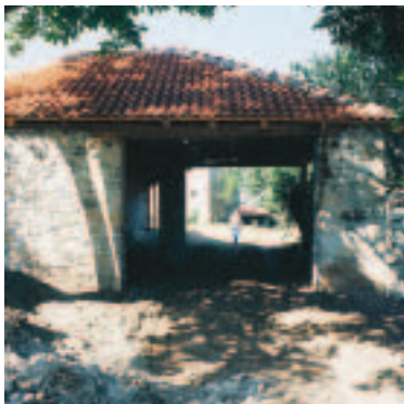
The cultural centre in the village of Dranoc is housed in a kulla.