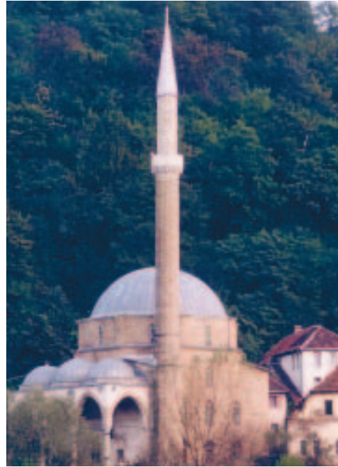
The mosque Kursumlija Dzamija in Maglaj, before and after restoration, Cultural Heritage without Border's initial project in the Balkans.

the domes. A tinsmith from Sweden was brought in to share his experiences with Bosnian colleagues.