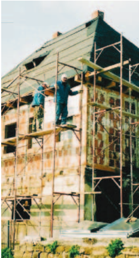
The restoration of houses to re-create parts of the historically important town centre of Jajce.

the restoration there was an acute situation as one of the arches was on the verge of collapsing due to subsidence in the soil. The foundations needed urgent reinforcement to avoid any collapse. Work was aggravated by the absence of electricity and because of the roads to the church had been destroyed.