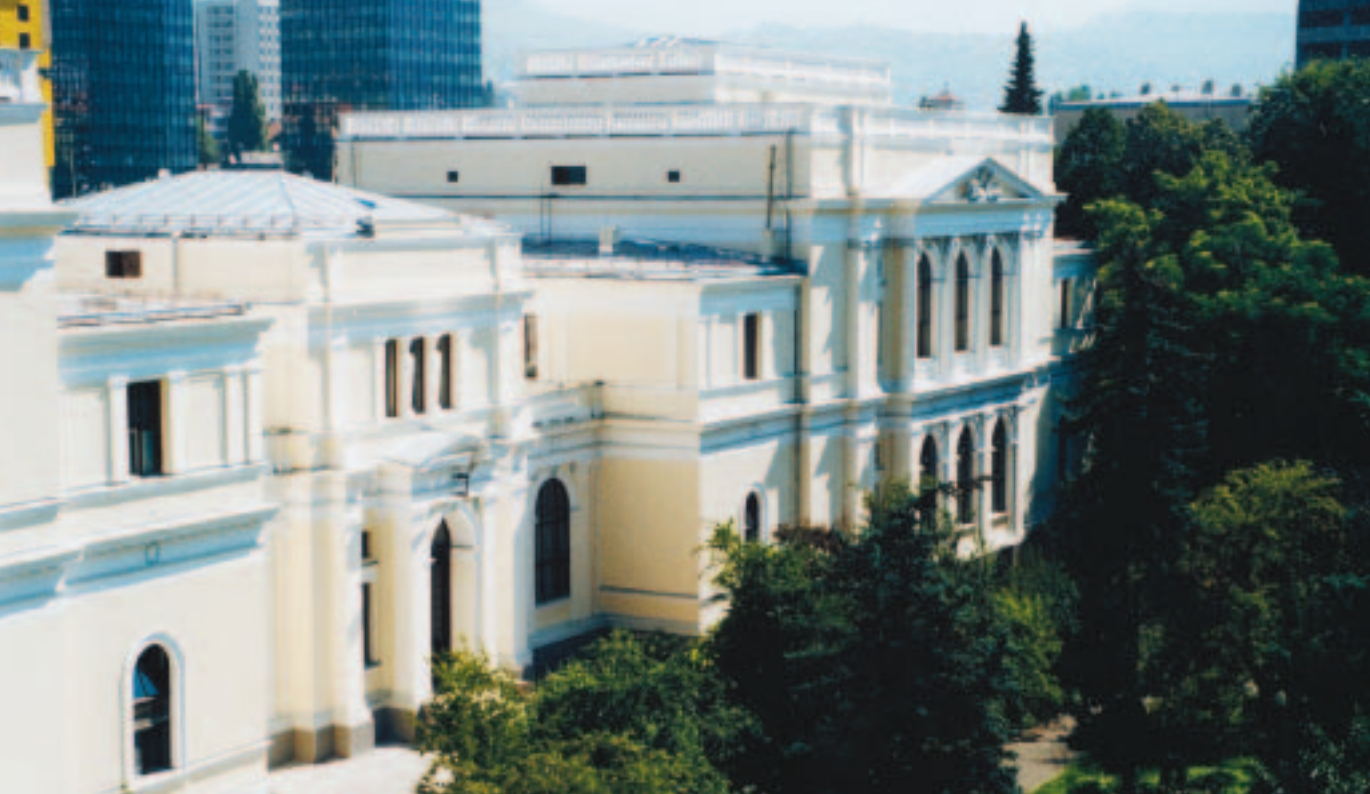
The National Museum, Zemaljski Muzej, in Sarajevo after restoration.

through its roof and some of the walls so that the sky-lights and masonry had been destroyed. Because of widespread damage it had rained and snowed into the exhibition halls. Problems were aggravated even further because the buildings had been replastered wrongly in the 1980's so that the walls could not be dried out properly.